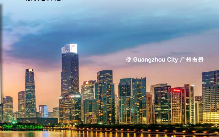
@ Guangzhou City 广州市景